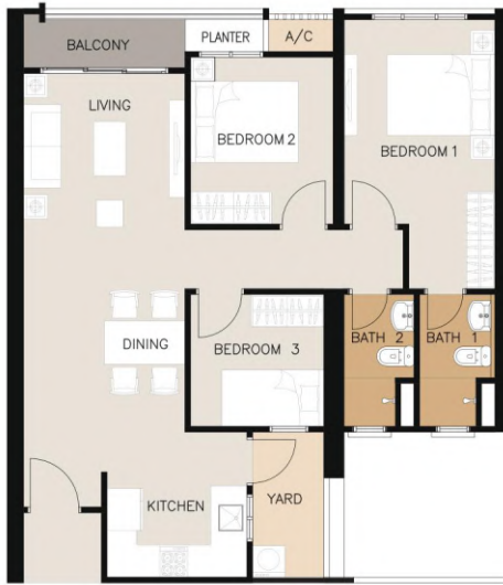
TYPE B - 850SF (UPGRADED UNIT) ( 3 BEDROOMS + 2 BATHROOMS )