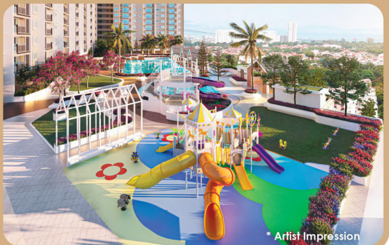
* Artist Impression