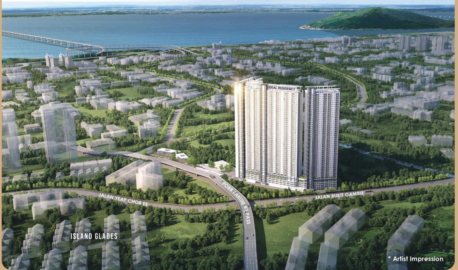
* Artist Impression