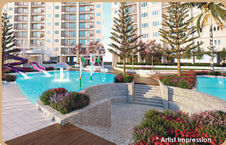
* Artist Impression